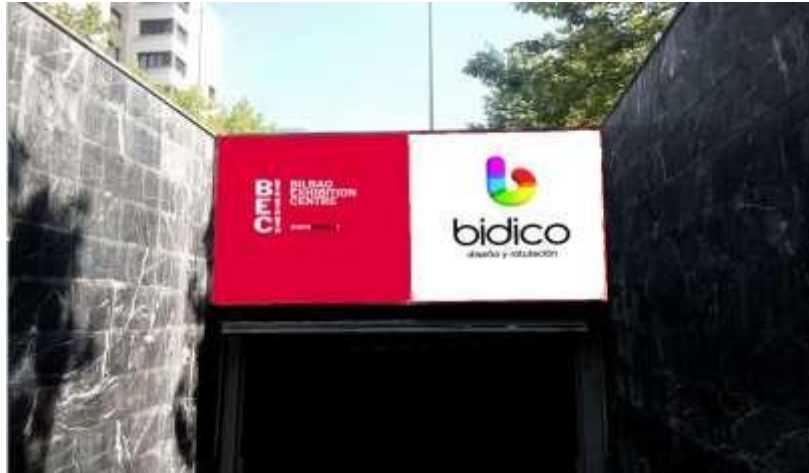
Image over the car park access door

Showcase your brand to visitors arriving at the venue in their private cars. Upon entrance to the car park tunnel, your brand will be showcased on a very large sign.